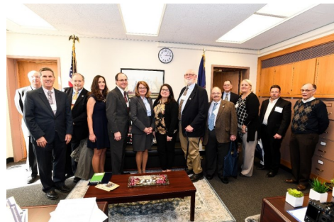
Cap Conference Albany 2/11/19