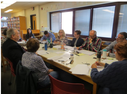
Area 2 Canandaigua Event 9/29/18