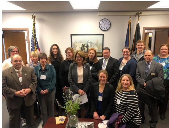
Capital Conference, Albany February 10, 2020

BLOOMFIELD CANANDAIGUA CLYDE-SAVANNAH DUNDEE GANANDA GENEVA HONEOYE LYONS MANCHESTER-SHORTSVILLE MARCUS WHITMAN MARION NEWARK NORTH ROSE-WOLCOTT PALMYRA-MACEDON PENN YAN PHELPS-CLIFTON SPRINGS SENECA FALLS SODUS SOUTH SENECA WAYNE WAYNE-FINGER LAKES BOCES WILLIAMSON